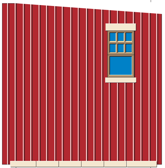
You have permission to use this graphic for your personal use. You are not allowed to publish or distribute this graphic in any way or to use it in commercial products. For more information, please contact us at www.BigIndoorTrains.com/contact.thm.