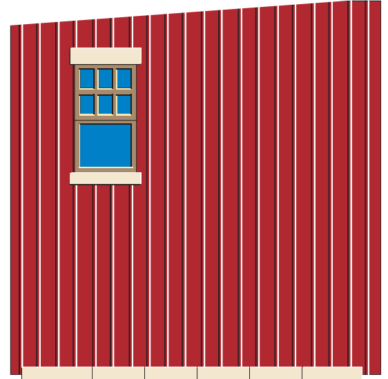
You have permission to use this graphic for your personal use. You are not allowed to publish or distribute this graphic in any way or to use it in commercial products. For more information, please contact us at www.BigindoorTrains.com/contact.htm